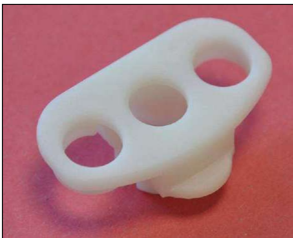
Holder for 3 x 2mL tubes

Use the appropriate holder with the tubes of the lysing kits range defined by Bertin Technologies on the website www.precellys.com .