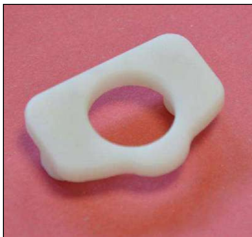
Holder for 1 x 7mL tubes