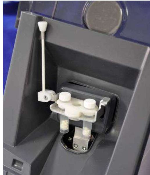
Correct and only position for 2 tubes