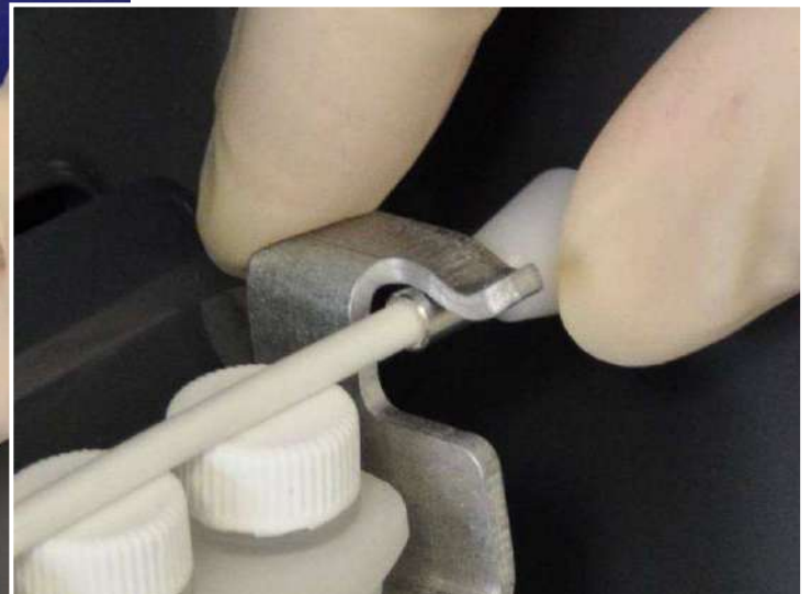
Tube blocking rod locked position