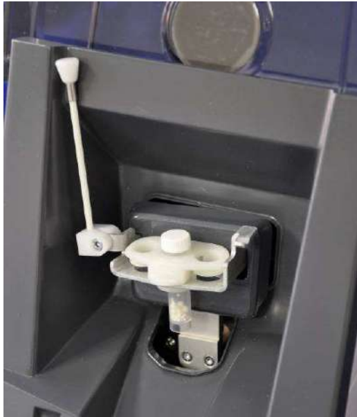
Correct and only position for 1 tube